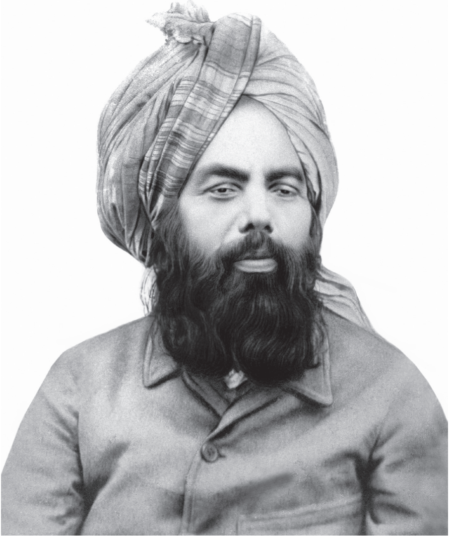
Hadrat Mirza Ghulam Ahmad of Qadian The Promised Messiah & Mahdi as